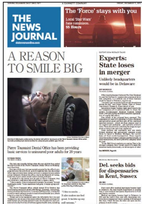
The News Journal newspaper's Dec. 11 front page featured a story about Pierre Toussaint Dental Office.