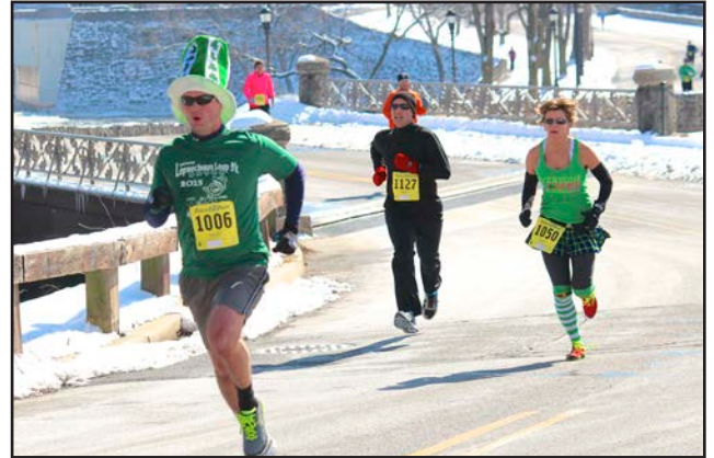
Runners braved the cold for the fourth annual Lee Gallagher Leprechaun Leap.