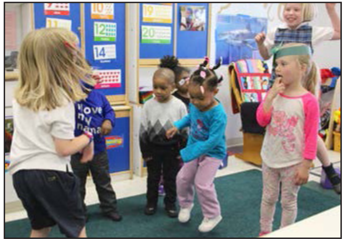
Brownie Troop #1087 visited Guardian Angel Child Care.