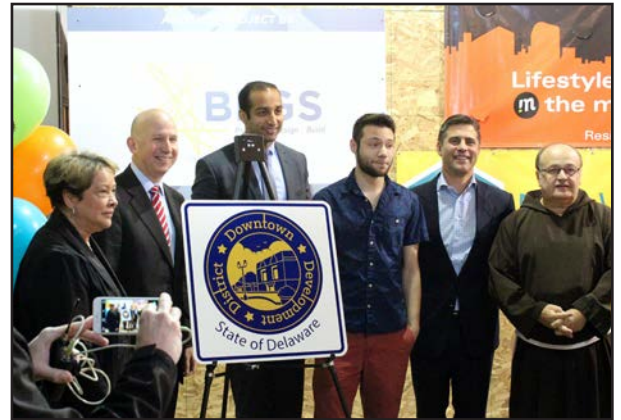
The Delaware State Housing Authority announced that the Ministry would receive $557,000 in Downtown Development District funding for construction of Sacred Heart Village II.