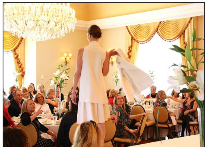
Eleganza, a fashion-show luncheon fundraiser, was held at Wilmington Country Club.