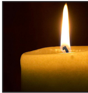
It's a wholesome thing to pray for the dead.