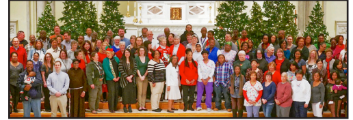
2015 Staff Photo