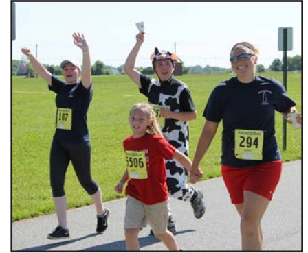
Inaugural Milk Run