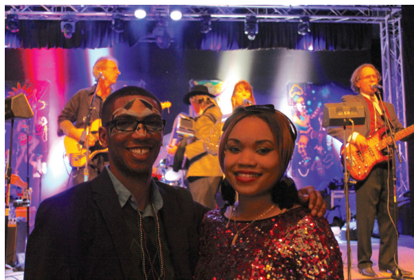
Mardi Gras Party

FEBRUARY 25 – Mardi Gras fundraiser with live music, Cajun cuisine, supports House of Joseph II for formerly homeless people living with HIV/AIDS