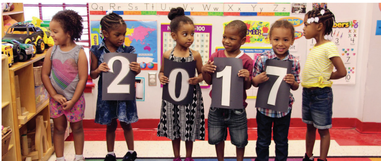
Hello 2017 from the littlest members of the community that we serve at the Child Care Center on Jackson Street.