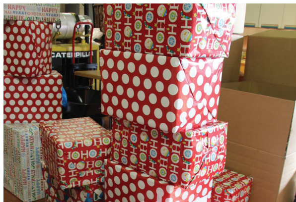
Supporters provide holiday gifts in our Adopt-a-Child program.

DECEMBER 21 – New Castle County Emergency Medical Services personnel help the ministry’s Adopt-A-Child program give donors’ holiday gifts to more than 1,000 children