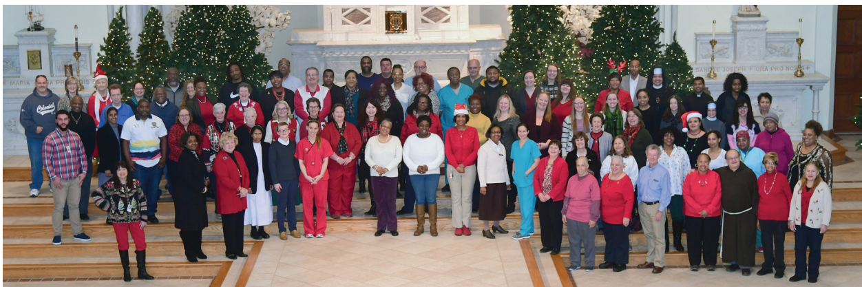
Staff gather for our annual photo after the 2017 Christmas breakfast.

The Ministry of Caring ended 2017 with 215 staff members. The 164 regular staff included full- and part time employees, pool staff, resident managers, Lutheran Volunteer Corps members and AmeriCorps volunteers, House of Joseph Training Program participants along with 51 support staff. Making up the support staff were 15 members of the National Able Network, 12 Capuchin Poor Clares, 11 seniors from Foster Grandparents of Delaware, eight permanent volunteers and five St. Francis Hospital employees.