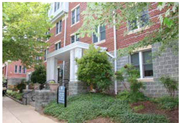
The front entrance to Sacred Heart Village I