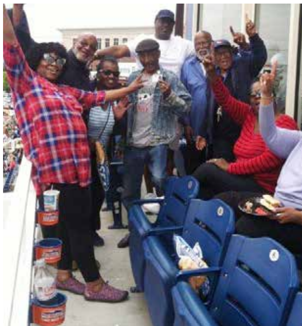
SHV residents show their team spirit on a group outing to see a Blue Rocks baseball game in Wilmington.

1999 – Construction plans are submitted to U.S. Department of Housing and Urban