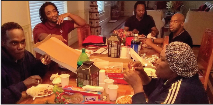
The residents of Mother Teresa House enjoying a meal that was provided by the Mother Teresa House Board of Directors.

"It's not how much we give but how much love we put into giving." – Mother Teresa