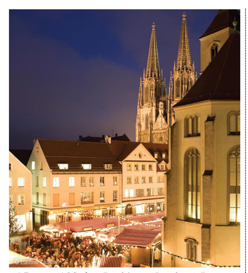
9 Days • 19 Meals: 7 Breakfasts, 5 Lunches, 7 Dinners

HIGHLIGHTS... Vienna, 6-Night Danube River Cruise, Hofburg Palace, Vienna Opera House, Wachau Valley, Glühwein Party, Passau, Regensburg, Nuremberg, Rothenburg, Würzburg, Christmas Markets