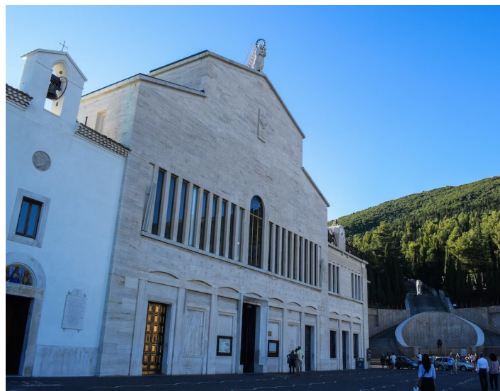
Santa Maria delle Grazie.

A day trip to San Giovanni Rotondo. Situated in the Puglia region of southern Italy, San Giovanni Rotondo is renowned as the hometown of Saint Padre Pio, a beloved Italian saint. Embarking from Bari, you'll travel through scenic landscapes, passing charming towns and countryside. This magnificent pilgrimage site attracts millions of visitors each year. Inside the shrine, you can explore the sanctuary, which includes the Church of Santa Maria delle Grazie, where Padre