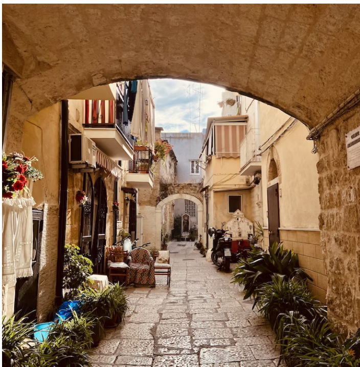
One of the hidden alleys of Bari.

Following breakfast at your hotel, you meet your guide and enjoy a 3-hour private guided city tour of Bari, a sparkling resort town with a lovely historic center. During the tour you stroll the maze-like Bari Vecchia - medieval heart of the city and see its major attractions including the 11th-century Basilica di San Nicola. You enjoy views of Piazza Mercantile, Piazza Ferrarese and