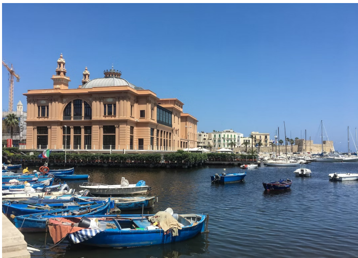
Beautiful Bari.

Day 1, Wednesday, November 1: Departure from JFK via ITA to Rome, Italy, connecting to Bari.