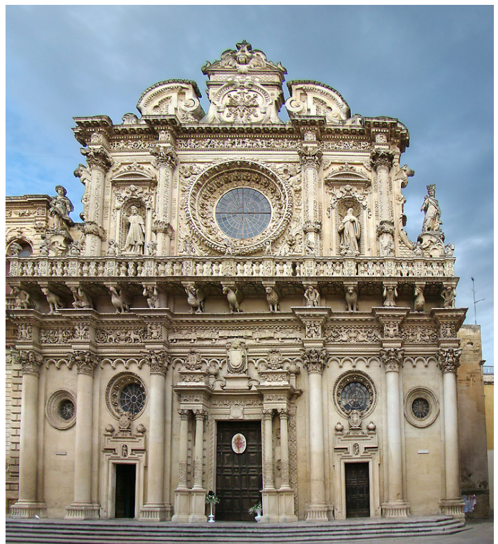
Basilica di Santa Croce, Lecce.