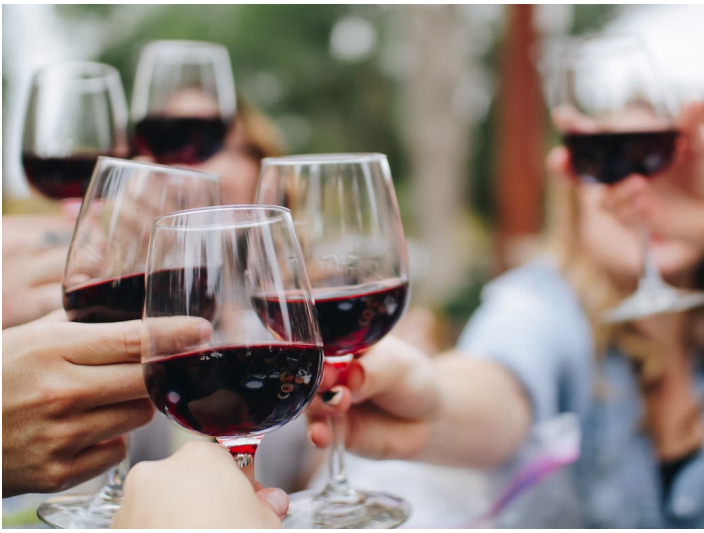
Cheers to our Italian adventure!