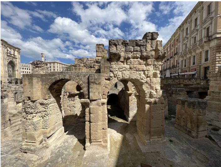
Piazza Sant'Oronzo, Lecce.