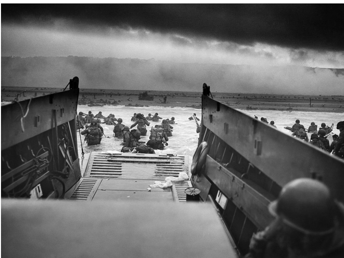
Fox Green section of Omaha Beach, June 6, 1944. U.S. forces of Company A, 16th Infantry, 1st Infantry Division (the Big Red One) wade ashore from a landing craft deployed from the U.S. Coast Guard-manned USS Samuel Chase.

Together with our English-speaking driver, today we enjoy a day trip to the cities of northern Brittany. Starting in Saint-Malo (the setting for Anthony Doerr's novel All The Light We Cannot See ), we'll explore the historic center of this 18th-century town and its defensive wall surrounded by the Emerald Coast (Côte d'Émeraude). Next, we visit another UNESCO World Heritage Site—Mont-Saint-Michel—known as the 'Wonder of the West,' famed for the Benedictine Abbey of Mont-Saint-Michel and dedicated