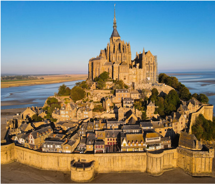
Le Mont-Saint-Michel

Full day private trip to Saint-Malo and Mont-Saint-Michel & Mass.