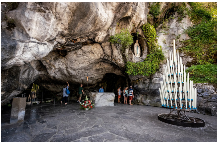
The Grotto at Lourdes

Today, we will experience the spiritual essence of Lourdes in a concise four-hour tour, focusing on the city's most revered Catholic landmarks. Lourdes, known for its Marian apparitions to Saint Bernadette Soubirous, is a center of pilgrimage and faith. We begin our tour at the Sanctuary of Our Lady of Lourdes, encompassing the Grotto of Massabielle, where the Virgin Mary is said to have first appeared to Bernadette on February 11, 1858. Today, this sanctuary is a place of prayer and private reflection, featuring the Basilica of the Immaculate Conception and the Basilica of Our Lady of the Rosary, known for their stunning architecture and for their religious significance.