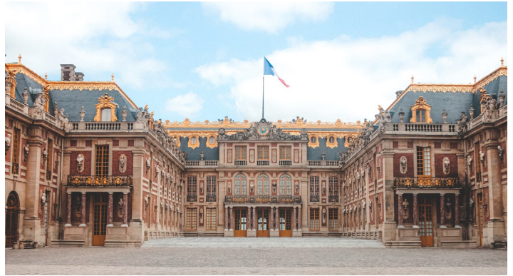
Palace of Versailles, photo by Mathias Reding.

We will walk the processional route, capturing the essence of the pilgrimages and processions that define Lourdes, before visiting the Baths, where pilgrims immerse themselves in the spring waters, believed to have healing properties. Our tour will also include a visit to the Musée Sainte-Bernadette, which offers insights into the life of Saint Bernadette and her impact on the Catholic world. We conclude our day with a visit to