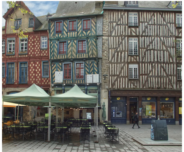
Place Sainte-Anne, Rennes

Bernadette's birthplace, adding a personal dimension to her story. This tour offers a comprehensive exploration of the Catholic heritage of the city and is ideal for those seeking a deeper understanding of the city's religious significance.