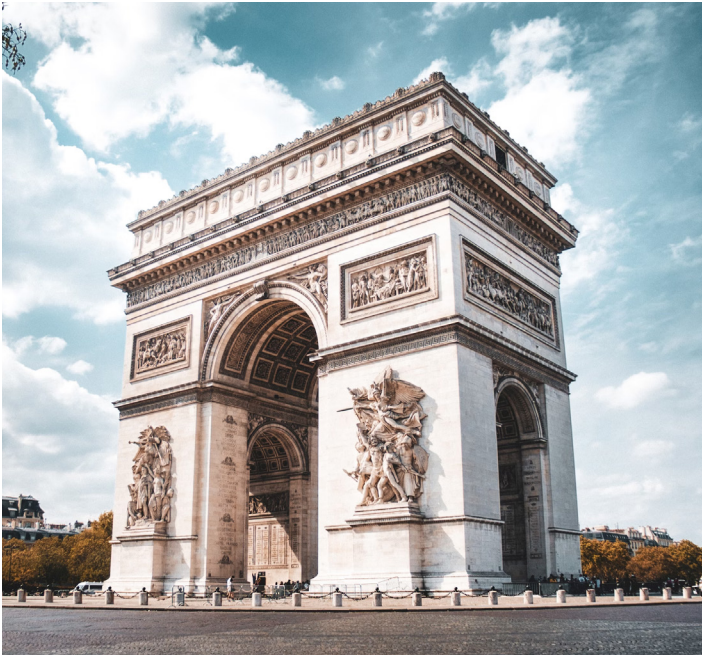
Arc de Triomphe

Day 1, Wednesday, November 6. Depart from Philadelphia on an overnight flight to Paris via American Airlines.